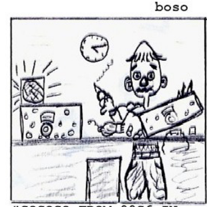
"CQCQCQ FROM 99G6 IN OOGA-OOGA-ANYONE ON??"