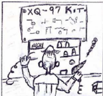
"This kit's a cinch..."