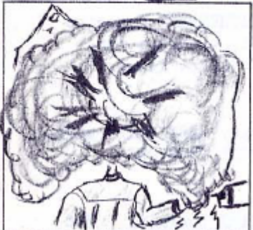
".....sure did ....."

TRAFFIC: Fourteen stations reporting for the month of July, resulting in a pretty good traffic count. A couple of stations, conspicuous by their absence; KP4AZJ, KG4AM, W6FCS, K6MCA and KH6BGS. Anyway, would appreciate hearing from them, so we can add them to the month's totals. Listings arriving after we "go to press" (yuk) will be carried next month.